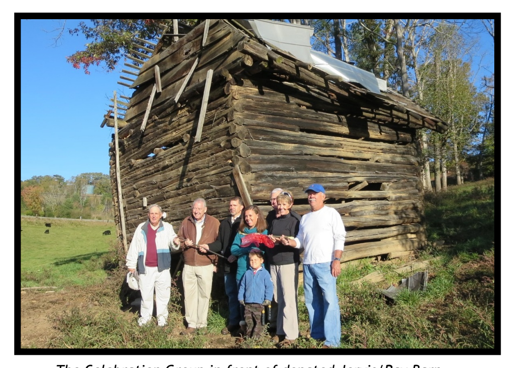
The Celebration Group in front of donated Jervis/Ray Barn