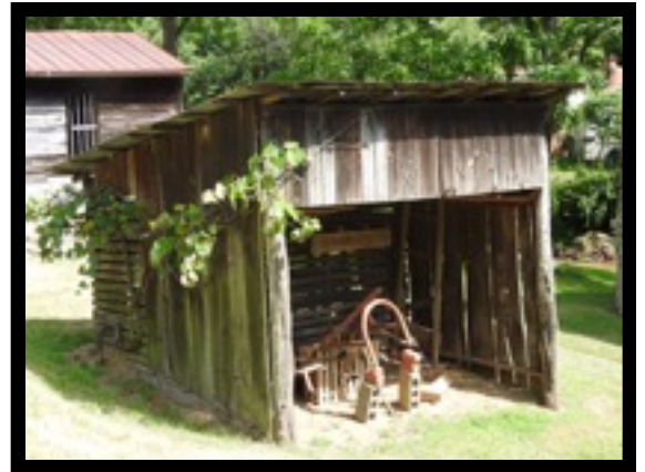
Roberts corn crib, tool shed, & grape

Friday May 4, 7:30PM - lecture and tour of “ Shelter on the Mountain: Barns and Building Traditions Of the Southern Highlands ” exhibit at the Rural Heritage Museum at MHU.