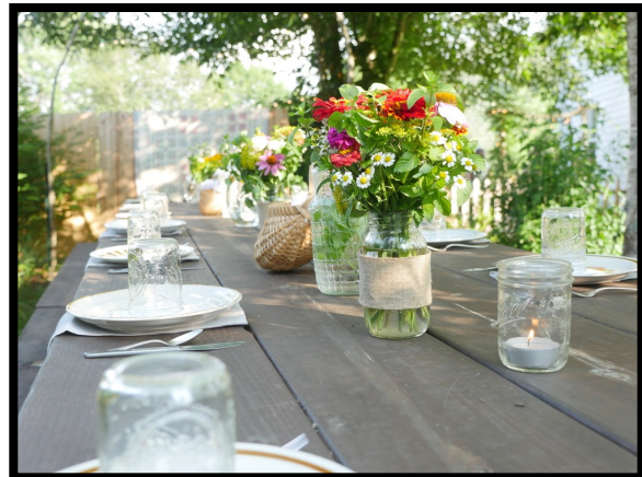
Dining al fresco at The Farmer's Hands

We are able to offer this at $35 a ticket ($30 for 2016 members) because the quantity (but certainly not the quality) of the food is less than the amount served at their scheduled Farm to Table Dinners. For reservations, email info@appalachianbarns.org or call Nancy Larkin at 828 230-6982. Only 30 tickets are available.