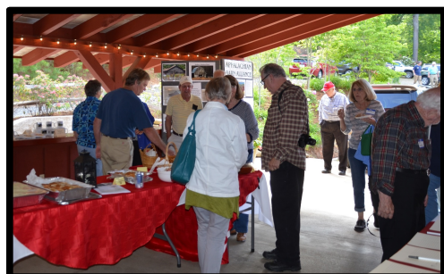
Some of the 75 Barn Day guests enjoy appetizers while perusing silent auction items at Steens' barn

The tour included other barns along the route, viewed from the bus, with fascinating narration by barn researcher Taylor Barnhill about history & function.