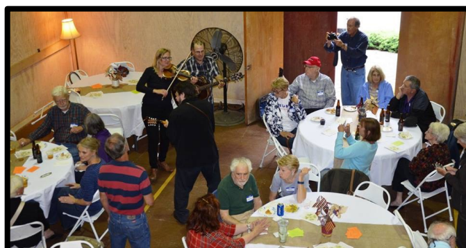
Musicians entertain at the dinner catered by Chupacabra Latin Café in Woodfin