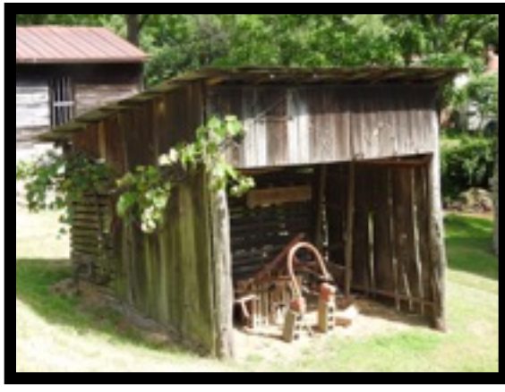
Roberts corn crib, tool shed, & grape

Friday May 4, 7:30PM - lecture and tour of "Shelter on the Mountain: Barns and Building Traditions Of the Southern Highlands" exhibit at the Rural Heritage Museum at MHU. Saturday May 5, 5:30 - 7PM - Opening Reception for Madison County Arts Council exhibit "Barns of Madison County", Marshall Saturday May 13, 6:30PM - Supper Club Dinner at The Farmers Hands, Marshall, For more information: www.thefarmershands.com Sunday May 14, 1 - 3PM - Color Drawing Barn Journal workshop, Madison County Saturday May 20, Appalachian Barn Alliance BARN DAY; 2:30PM Bus Tour, 6:30PM Dinner and Silent Auction, Mars Hill Sunday May 21, 1-4PM - "Mad Spinners" demonstrate wool spinning on the MHU Quad.