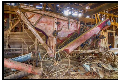
Ethel Kirkpatrick of Spring Creek has made a loan of a rare 19 th century threshing machine. This museum-quality thresher will be an exemplary artifact of draft animal-powered farm culture of the southern Appalachians.

The ABA welcomes donations of old barn building tools and farm implements from across Madison County to be part of its future heritage farmstead. Currently you can view the farm sled in the Rural Heritage Museum’s exhibit. A display of barn building tools is also there and will return to the lobby of the NC Cooperative Extension Office at the end of the exhibit.